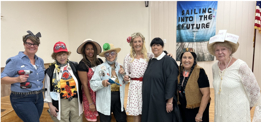
Rosie the Riveter, Amelia Earhart, Laura Ingalls, Rhinestone Cowgirl, Shirley Temple, Ruth Bader Ginsburg, Sacagawea, Woman's Right to Vote.

The DBWC Dressed up for Woman's History Month and read snippets of books regaling their life stories and tales of their adventures! From Emelia Earhart, Rosie the Riveter and even Sacagawea graced our building for a fabulous and historical meeting! Thank you to all that dressed up! and